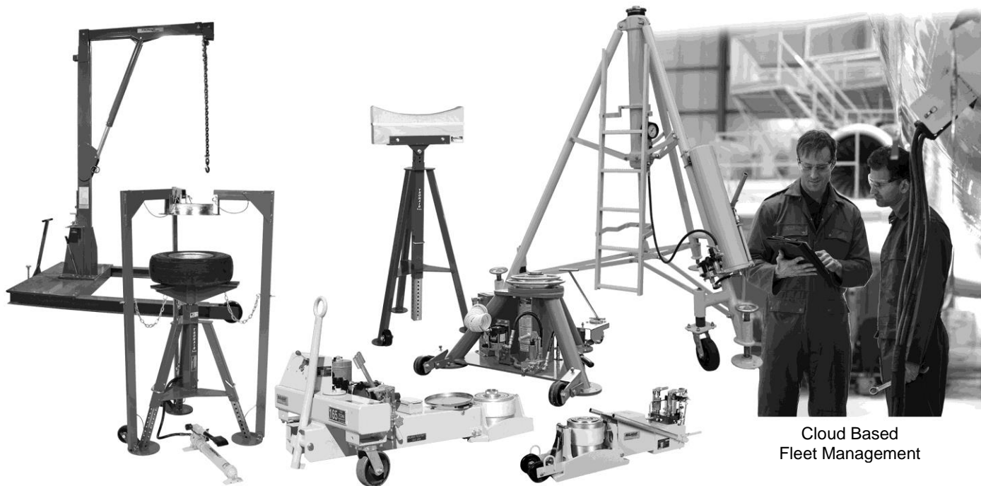
Cloud Based Fleet Management

The Tronair Family of Ground Support Equipment and cloud based EBis GSE Fleet Management