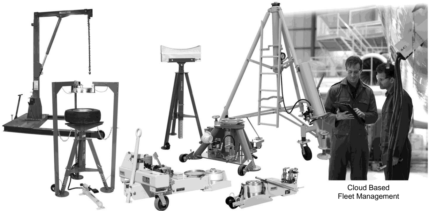
Cloud Based Fleet Management

The Tronair Family of Ground Support Equipment and cloud based EBis GSE Fleet Management