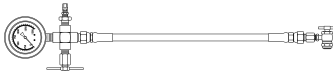
Model: 14-6895-6000 Aircraft Strut Pressure Gauge