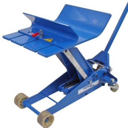
Model: 14-6911-0100 Universal Tool Strut, Brake, Tire